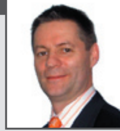
President and CEO Syscan International

A: “Global livestock traceability, electronic animal identification (EID), tracking, tracing and authentication concepts are becoming increasingly widespread; EID forms one of the most important elements of any effective traceability system to assure food quality, particularly safety, in agri-food chains worldwide. Today we have four patterns of adoption in major producing and trading countries: mandatory systems in response to consumer concerns (EU and Japan); mandatory traceability to maintain or enhance export market shares (Australia, Brazil, and Argentina); industry-managed mandatory programs for animal ID (Canada); and voluntary systems (US). By working closely with different user groups, government or semi-government agencies, EID and animal movement tracking solutions among all stakeholders will turn into real value and compliance propositions. Overall, it is clear that EID traceability will become an increasingly integral feature of markets for food products and the countries that have already adopted such systems have positioned themselves to reap the economic benefits, either domestically or in export markets.”