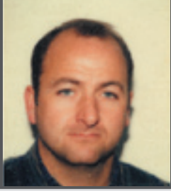
CEO Dalton Group

A: “The topic of livestock traceability for disease and breeding has been around for almost 100 years but over the coming years the issue of consumer confidence will add value and drive identification concepts. The commercial reality is that the benefits of any ID system are offset by cost, and some governments and organizations have thus shown great hesitancy in adopting any scheme that appears to penalize livestock producers. Technology solutions are now a commercial reality. Their ability to add value at every level of the food chain will lead to an availability of data at consumer level previously unforeseen. While several countries already employ ID techniques for traceability, within the next 5 years one would expect a global adoption of such systems thereby avoiding trade and tariff constraints or trade barriers created by a lack of traceability between countries. In 5 years time the scare tactics used by media organizations to frighten consumers will no longer be able to be applied to meat. Labelling and interactive information services at the point of sale will allow the retail trade to clearly differentiate quality products, and consumers will support animal welfare by paying the price for clearly identified produce.”