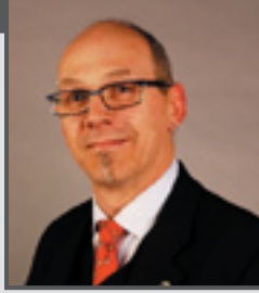
Managing director PlanetID

A: “The electronic identification of animals is the only business field where there is a real and closed ISO standard, which has offered countries the opportunity to take decisions for the official identification of animals with RFID devices. More and more countries will decide upon an official use of the RF identification. This process will certainly continue over the next five years. The fact that there is a well-constructed and accepted standard offers more and more new readers, new additional devices and applications based on this technology, which will increase confidence on the user side. The new ISO standard 14223 is on the way to being finished and should be available in about 4-5 years. The ISO standard for r/w animal transponders will open up completely new possibilities on the animal market. This consists of different market segments and so their idiosyncrasies have to be taken into consideration. Unfortunately more and more places are establishing test procedures that will only increase prices and not user confidence.”