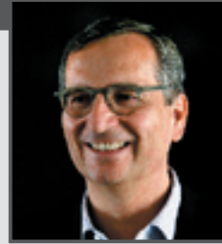
CEO and co-owner AEG ID

A: "We have to distinguish between two major market segments: animals that are identified with transponder implants (e.g. pets) and animals that are identified with either ear tags or a bolus (e.g. livestock). The transponder in a 2mm diameter glass tube is a mature product that has been implanted in well over 50 million animals. It is used for companion animals, zoo animals, but also for fish and research animals and horses. This market segment is characterized by steady growth, which will certainly continue over the next 5 years. A vision of the future may involve a user-defined memory in the transponder. Information on animal health can be stored there as well as the telephone number of the owner. These features are reflected in an advanced ISO Standard, currently being worked on. On the other hand, the electronic identification of livestock will be driven by legislation. In Australia the majority of bovine animals are "tagged" with RFID, whereas in the EU a regulation for sheep and goats was issued using ear tags and bolus. I expect the majority of the 90 million sheep in the EU to be identified with RFID within the next 5 years. The same will then apply to livestock animals."