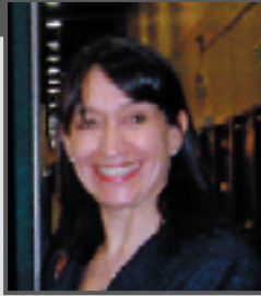
Head of Animal ID Division Datamars

A: "Since the introduction of RFID products for animal ID in the 80s where some non-compatible systems were offered, interest in this ID method has grown. The products found their first major application with fish, followed by pigeons, pigs and pets. The ISO 1174/11785 standards in 1996 created a basis, enabling authorities, international organizations, and agriculture ministries to include this method in regulations such as the pet travel scheme in the UK, the EU health certificate for dogs, cats and ferrets, and the EU Council regulation for the identification of ovine and caprine. Tattoos and other methods are being replaced by RFID because it is painless, fast and animal-friendly. Vets, border authorities, the shelter community and kennel clubs rely on RFID transponders and reader devices, and on secure, fast and efficient databases. Given all regulations, we might estimate that within 5 years 50% of pets in Europe will carry a chip under the skin. N.America and Australia are steadily increasing the numbers of their livestock that are electronically identified. The future for this technology is bright and brings with it proposals like plastic encapsulated transponders and chips with r/w capability and sensors."