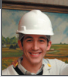
President Somark Innovations

A: “Consumers, which range from ordinary individuals to export markets governed by public officials, are demanding more information about the source, age, production, and genetic makeup of the food they consume. I use the word “demand” because they are willing to pay a significant premium for this information and often alter eating habits to avoid items lacking the desired data. In order to deliver such information, all players in the supply chain must embrace a robust cross-platform information system. The obvious requirements for such a system, to be fully utilized and value appropriated from premium paying customers, is a 1) cost effective, 2) secure, and 3) a “speed of commerce compatible” animal ID system. It is for these reasons that I believe the area of animal ID will experience significant interest, growth, and investment throughout the next five years.”