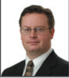
VP Sales and Marketing Optibrand

A: “Animal ID needs to be viewed in one of two categories – regulatory ID and value-added ID. Regulatory ID has traditionally been a cost to the livestock producer and serves only to track disease while value-added ID has given livestock producers the opportunity to gain premiums for the products they produce due to the ability to verify who, how old, and where the products came from. In the next five years we will see a significant increase in the use of animal ID for value-added purposes. In addition to this, producers of livestock products will continue to adopt new and innovative methods of identification to further differentiate their products from their competitors. Due to the susceptibility to tampering and loss of traditional ID methods such as tags (both visual and RFID), livestock producers will adopt secure biometric methods such as retinal imaging and DNA. This will allow them to meet customer demand and expectation for reliable proof of important production claims.”